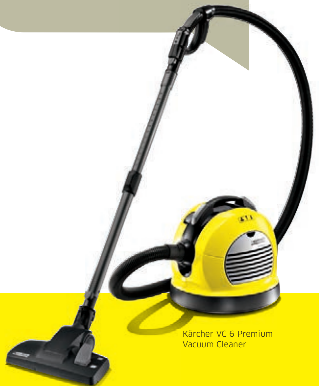
Kärcher VC 6 Premium Vacuum Cleaner

The vacuum cleaner field test of the "Power Saving Initiative" campaign in November of 2014 confirmed that the Kärcher VC 6 Premium makes a contribution to climate protection. As the machine with the lowest wattage in the test, it achieved the highest rating in five out of nine categories, prevailing over five other brands/models with wattages of up to 1,000 watts.