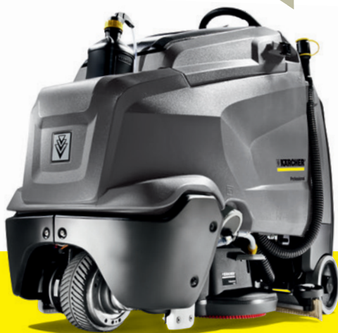
Kärcher scrubber drier of the eco!efficiency range

Numerous scrubber driers are equipped with the particularly energy-efficient eco!efficiency mode. This machine cleans with a lower blower power, reduced cleaning agent consumption and a lower brush speed; therefore, it can be operated for longer and is quieter and more energy efficient. Up to 50 per cent can be saved on energy and water, with impressive cleaning results at the push of a button.