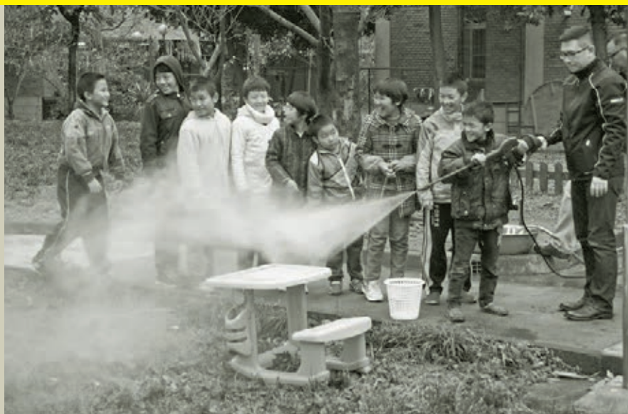
Thanks to these nine junior cleaning professionals and their Kärcher equipment, dirt doesn't stand a chance in the SOS Children's Village in Chengdu, China.

Playing, doing homework, shared dinners and small quarrels – all this is commonplace for the 60 boys and girls in the Württemberg SOS Children's Village in Oberberken, Schorndorf. The Children's Village family is just that: a completely normal family, in which, of course, a lot of housework accumulates. Fortunately, the SOS mother does not have to do it all alone, because all family members tackle the cleaning together. Working together, they make their home spic and span using vacuum cleaners and pressure washers donated by Kärcher for that purpose. In this way, there is more time for playing together when the cleaning is finished.