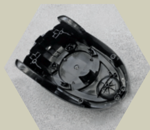
In this way, new product parts are made of the recycled material.