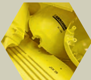
The defective parts are processed into granulate by a service provider.

The recycled material is obtained by collecting and sorting rejects; it is then fragmented by a recycling company, remelted and then further processed into granules. The high-quality granulate obtained in this manner can easily be processed again in an injection moulding machine. Numerous black plastic casing components will contain up to 40 per cent of this recycled material in future; the incidental rejects will thus be completely reused.