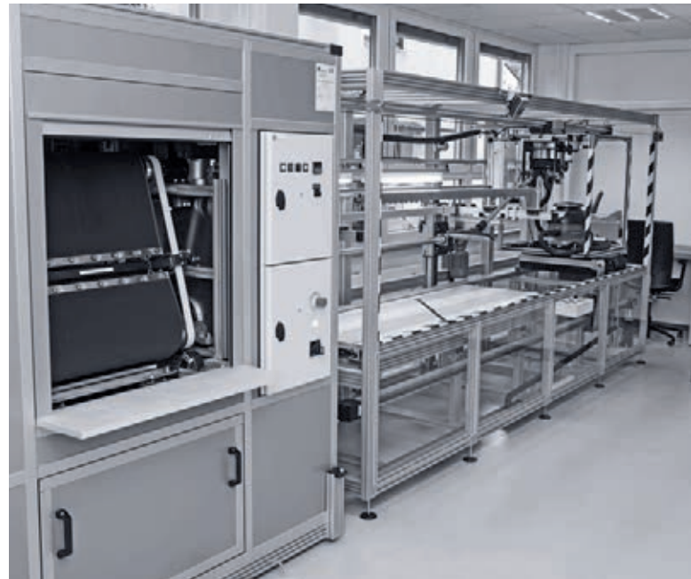
In the ErP laboratory for dry vacuum cleaners, energy use and dust intake can be measured during the cleaning of different surfaces.

Although we usually only notice an excessively high energy use when reading the electricity bill, we experience unpleasant or loud sounds immediately. Noise emissions are therefore also an important aspect which we include in the development of our products from the very beginning. Therefore, a reduction of 10 dB (A) is already perceived by operators as a 50 per cent reduction in the noise level. Because of this, our dry vacuum cleaners are ideally suited for longer operating periods and noise-sensitive areas such as hotels, nursing homes or hospitals.