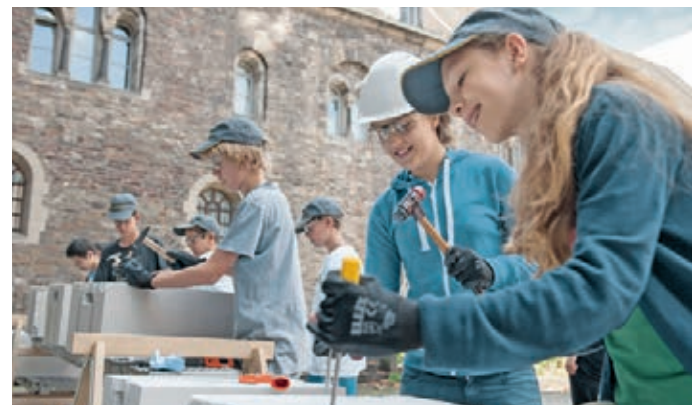
Girls and boys at a workshop in which they reconstruct the statues of the Chapel of St. Charles and St. Hubert.

The cleaning work at Aachen Cathedral is just one example of how Kärcher is involved in preserving historic and listed buildings and monuments for posterity. The work is always carried out in close cooperation with the relevant monument estates, the relevant authorities, restorers and art historians. This ensures that the most appropriate cleaning method is applied to each object.