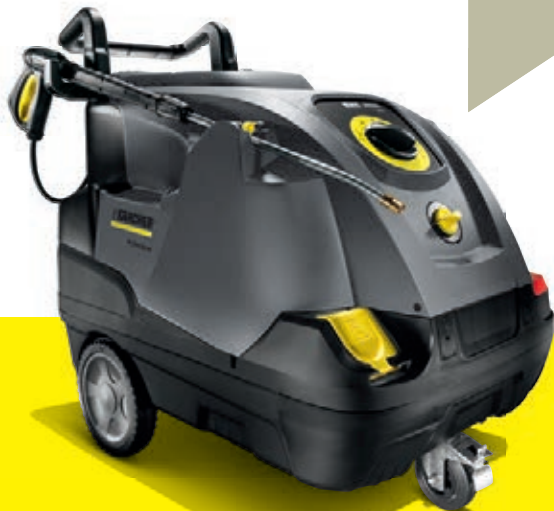
Hot water high-pressure cleaner

The European Association EUnited Cleaning has certified the burners for Kärcher hot water high-pressure cleaners as efficient and environmentally friendly. The high level of effectiveness and the low soot and carbon monoxide emissions were decisive factors for the certification in 2015.