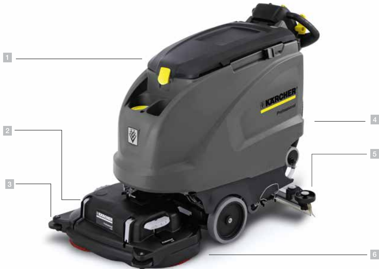
Shown with D 65 head

The Kärcher B 60 walk-behind scrubber is ideal for cleaning areas from 10,764 to 26,910 ft 2 . Interchangeable cleaning heads are available in working widths from 22" in to 26" with adjustable contact pressure. The Kärcher B 60 W can be configured entirely according to your particular cleaning needs.