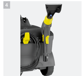
4 Cleaning in vehicles