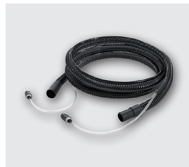
Spray suction hose