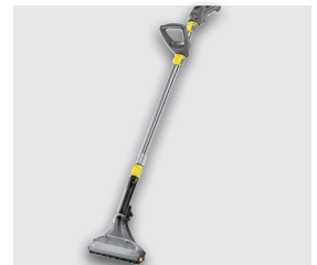
Floor tool kit with handhold