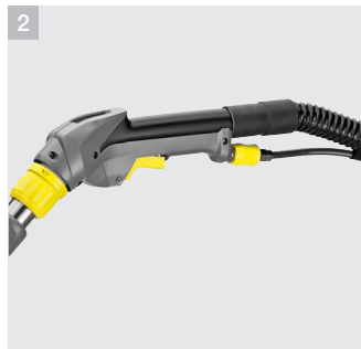
2 Hand tool