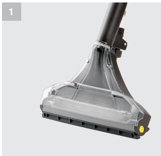
1 Flexible floor tool 9"

The Puzzi 10/1 spray extractor is specifically suited for cleaning of carpets and upholstery. The new floor tool with handhold offers comfortable ergonomic operation, guaranteeing optimal vacuuming at any angle. The powerful suction turbine on the flexible floor tool provides superior suction which decreases drying times (up to 30% faster). The Puzzi 10/1 also features new accessory storage and cable hook for the power cord.