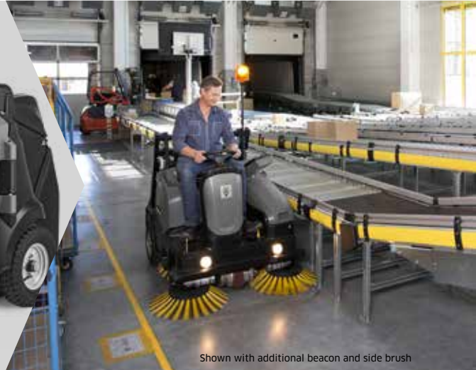
Shown with additional beacon and side brush