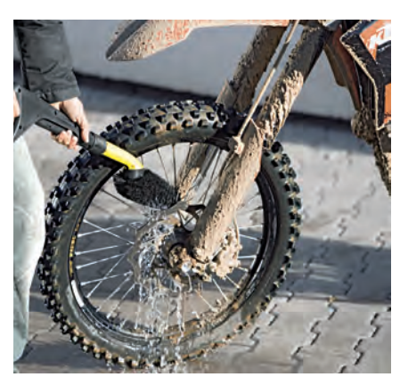
The rim cleaner cleverly changes colour to let you know when the contact time is up.