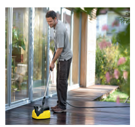
All-in-one protective formula to keep surfaces clean for longer and to protect against wind and weather.