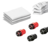
Multipurpose accessory kit (2.863-215.0)