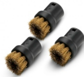
Round brush with brass bristles (2.863-061.0)