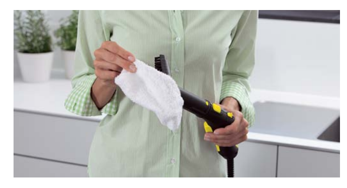
3. After a while grease accumulates in the towel. You should change towels every once in a while.