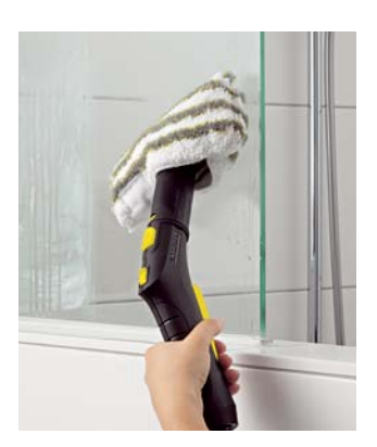
Scaling and soap residue Even stubborn residues can be easily removed with the abrasive cloth (microfibre cloth set, bath).