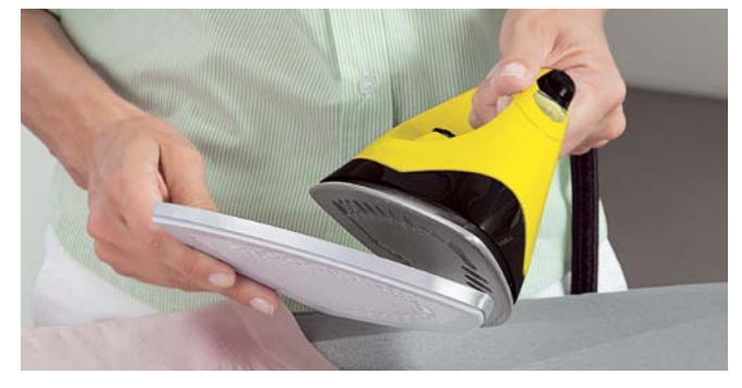
3. The teflon sole plate is a special accessory that prevents shiny spots from forming on delicate and dark materials (e.g. linen). And it also means you don't have to iron printed t-shirts inside out.