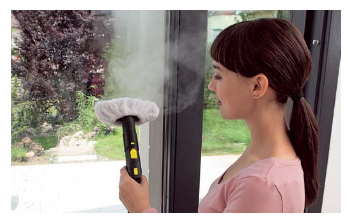
1. Thoroughly clean windows before using a steam cleaner on them for the first time. Then completely wipe over the windows using the hand nozzle and steam cloth. Tip for winter: If the windows are very cold warm them up from a distance of around 5 cm.