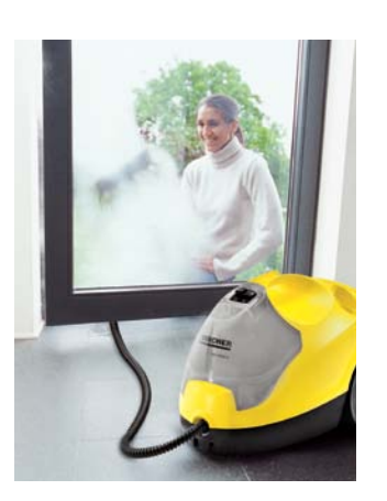
3. If the windows are to be cleaned from the outside, please do not take the steam cleaner outside for safety reasons! However this indicated problem can be solved, as seen in the picture above.