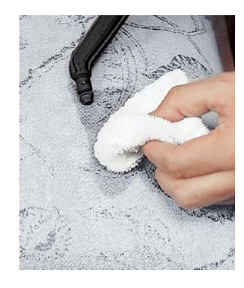
Cleaning upholstery Hold the detail nozzle sideways (not vertically!). The jet of steam "blows" the dirt from the stain into a cloth held next to it.