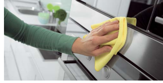
4. Polish the cleaned surface with the yellow microfibre towel to prevent streaks.