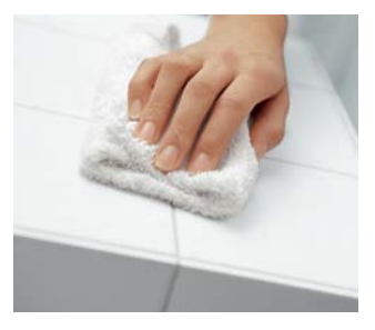
2. Even stubborn dried-in dirt can 3. Dry the surface with a towel after steam cleaning. Note for silicone crevices: apply steam only briefly in order to preserve the material.