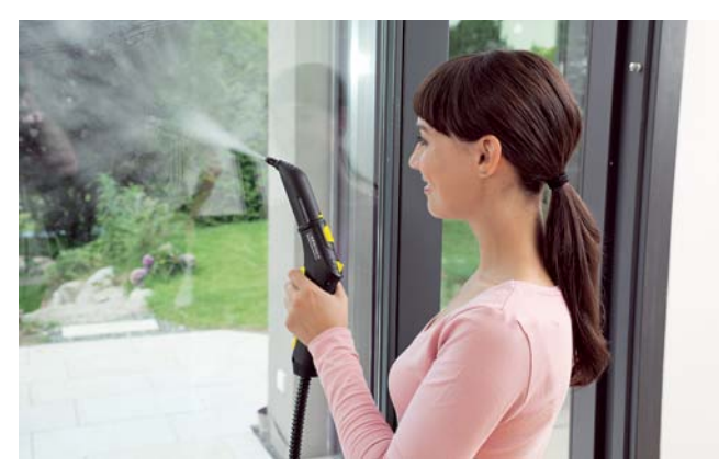
2. Apply steam to the glass surface from top to bottom using the detail nozzle.