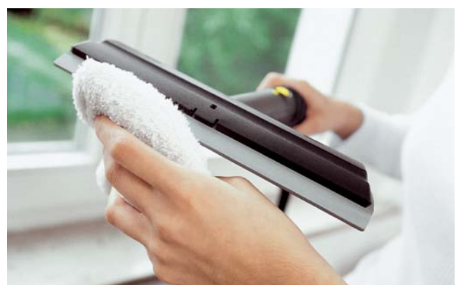
5. Then remove the steam with the rubber blade from top to bottom – and once horizontally across the bottom. In order to prevent streaks from forming, wipe the rubber lip dry with a cloth.