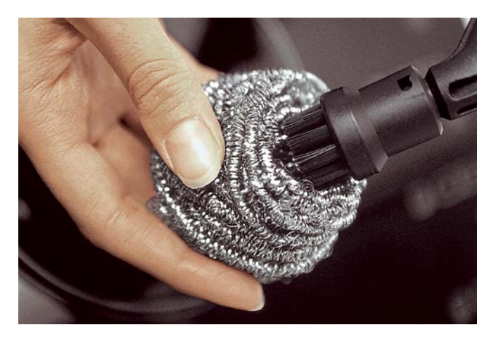
1. Glass ceramic surfaces are problematic for many cleaning tasks, but not for steam cleaners. A stainless steel coil is attached to the round brush. You can find one in any household department store.