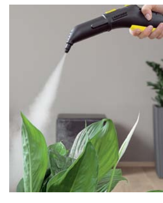
Cleaning plants Spray the plants from a distance of 20 to 30 centimetres and wipe of the dust with a cloth.