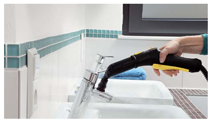
2. Put vinegar or citric acid on thicker layers of scaling and let it soak in.

3. Always remember that regular steaming prevents future build up of