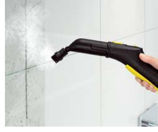
be removed with direct steam and scouring.