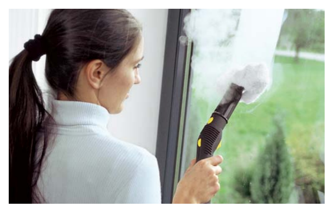
1. Clean windows before using a steam cleaner on them for the first time. Then completely wipe over the windows using the hand nozzle and steam cloth. Tip for winter: If the windows are very cold, warm them up from a distance of around 5 cm.