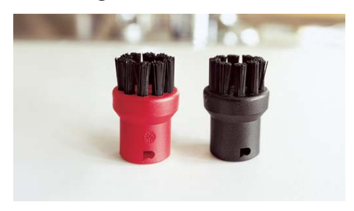
1. In order to prevent scratches to chrome and stainless steel fixtures, please only use the detail nozzle. Hold it very close to the object being cleaned and wait until the limescale has dissolved. If the dirt is not dislodged or is in a difficult area to reach, the nozzle can be used with a brush. Then simply rub away the spot with powerful blasts of steam.