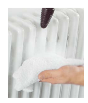
Cleaning radiators Use the detail nozzle to apply steam to the radiator. Wipe away dislodged dirt and moisture with a cloth. We recommend placing a towel on delicate floors in order to protect them from moisture.