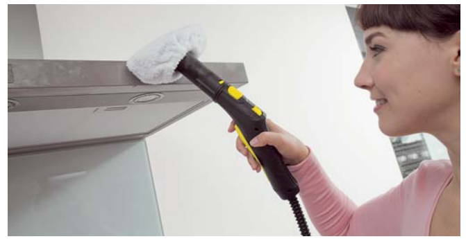
2. If the layer of grease is old, you will have to scrub vigorously. "Full steam ahead" is what we recommend in this case.