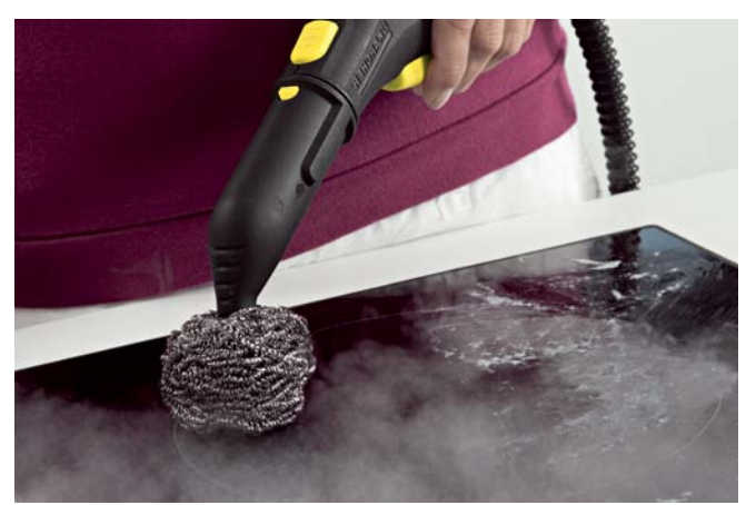
2. Steam will not leave any scratches on the glass surface. The steam forms a type of sliding layer during cleaning. Crevices and edges can be cleaned without a cover using the detail nozzle and edge brush (the round brush is attached to the detail nozzle).