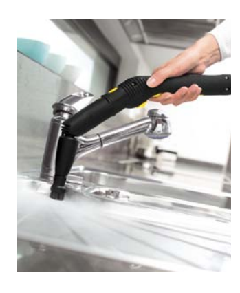
Heavy soiling The vibrating steam turbo brush dislodges stubborn dirt in half the time.