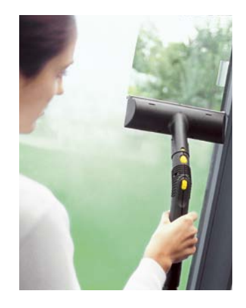
4. The next time you clean your windows it will be easier after this initial clean. The whole window should be steamed on both sides at a distance of 10 centimetres with several strokes from top to bottom with the window nozzle.