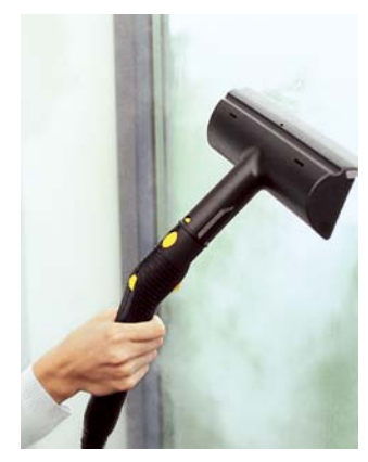
2. Then steam the glass surfaces with the window nozzle and clean away with the rubber blade of the window nozzle.