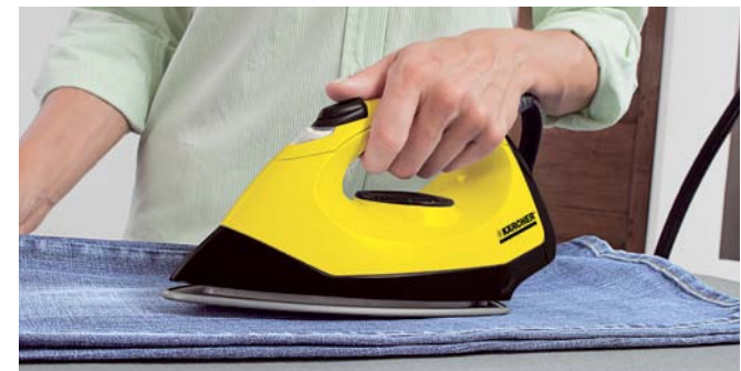
4. The steam pressure is so intense that you can also smooth out thick jeans from only one side. Do not put too much pressure on the iron and move it slowly over the laundry - the steam pressure works for you.