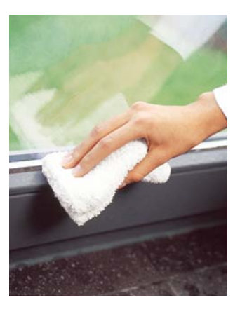
6. If, when removing the condensation with the rubber blade, there are some residual water drops – don't worry. These can be wiped away with the cloth without leaving streaks.