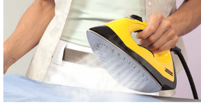
2. Set your iron to the maximum temperature when steam pressure overheated - regardless of whether it is cotton, silk or linen.

1. With the Kärcher steam pressure ironing system you can finish your ironing in half the time! The Kärcher ironing board has a steam extraction ironing. The continual steam prevents your laundry from being unit and an inflating device. The steam extraction fixes the laundry in place while the moisture is extracted. The ironing surface can be blown up like a balloon with the inflation device. This prevents the formation of creases even in delicate materials. A Kärcher steam cleaner with the 2tank system together with the steam pressure iron are the ideal solution for large amounts of laundry due to their continuously refillable water tank.