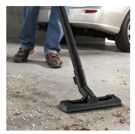
Newly developed floor nozzle

• For perfect cleaning results, with dry or wet, fine or coarse dirt.