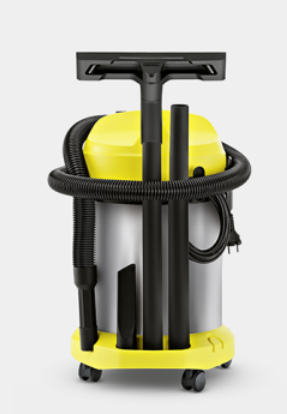
Practical cable and accessory storage

• For perfect cleaning results, with dry or wet, fine or coarse dirt.