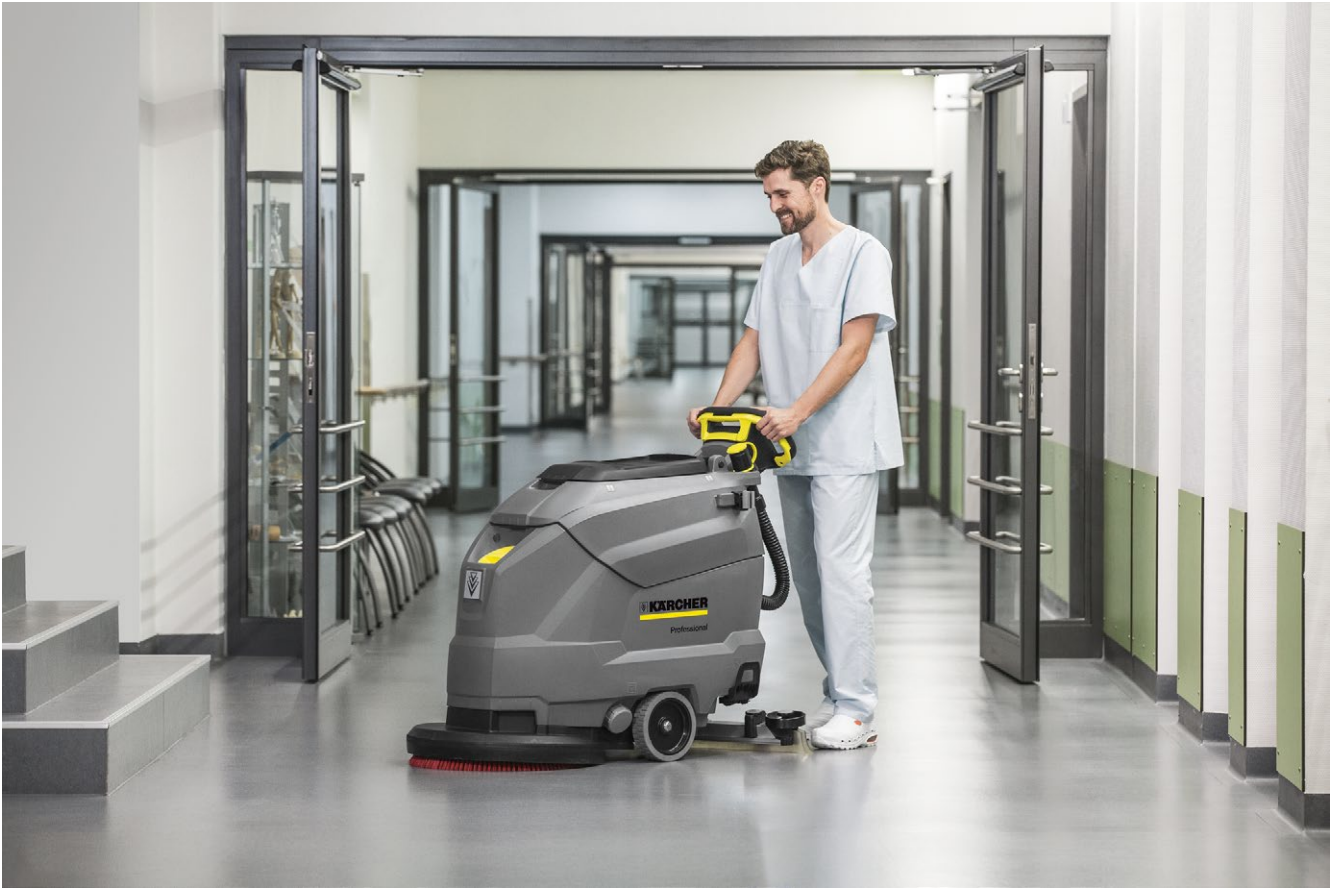
BD 50/50 C Classic Bp