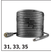
31, 33, 35