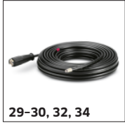
29-30, 32, 34