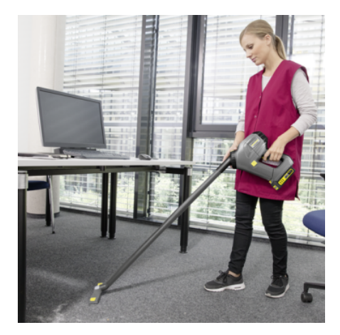
With large filter area and efficient turbine

• Strong cleaning performance on all surfaces.