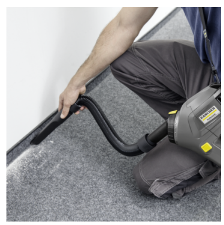
Compact, lightweight and flexible to use

• Strong cleaning performance on all surfaces.