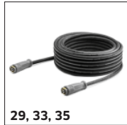
29, 33, 35