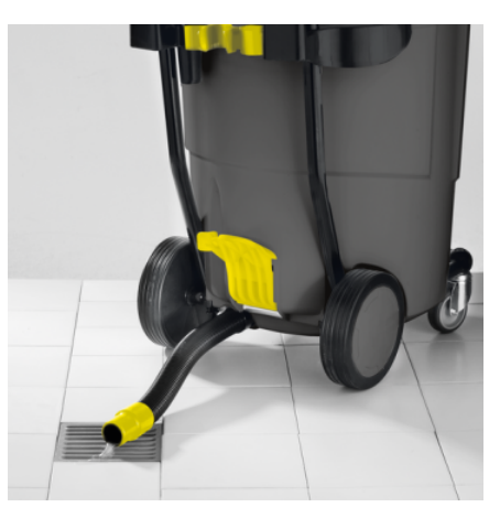
Integrated drain hose

• Large on-board storage area for tool and accessory storage.