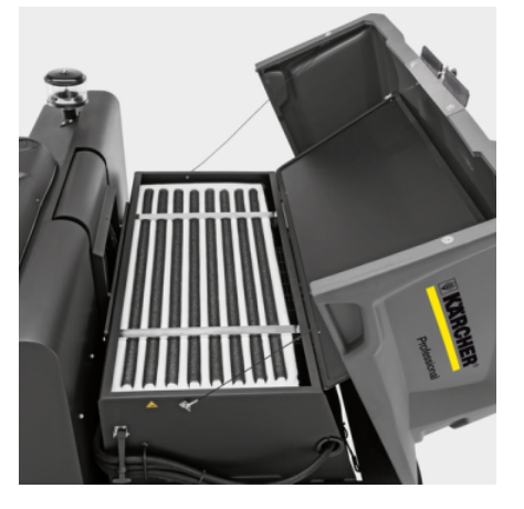
Large-area pocket filter with vibration motor