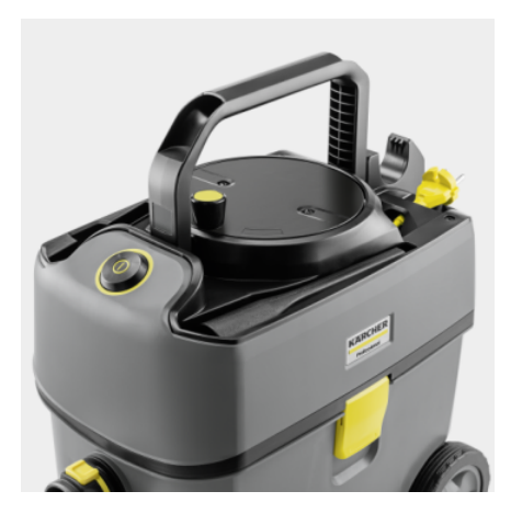
Sustainable and robust: 45% recycled content