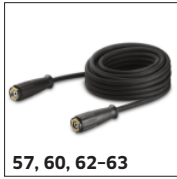
57, 60, 62-63