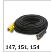
147, 151, 154