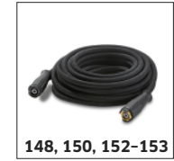
148, 150, 152-153