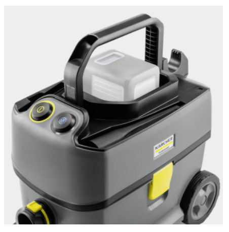
Sustainable and robust: 45% recycled content