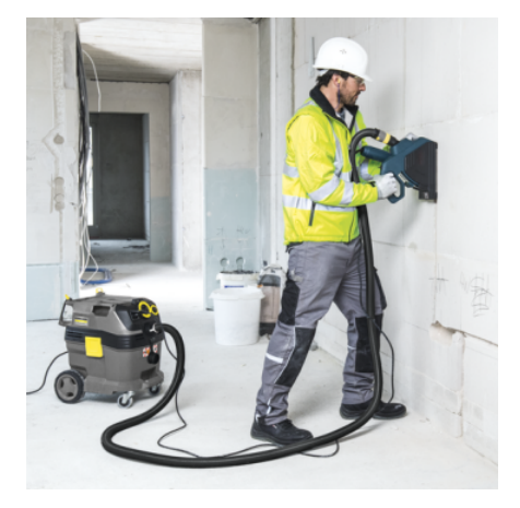
Tested filtration efficiency of 99.9 per cent

Sensor-controlled electronics for optimal filter cleaning efficiency and therefore maximum suction power.