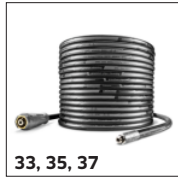
33, 35, 37