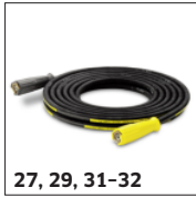
27, 29, 31-32