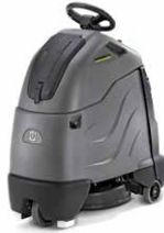
CHARIOT™ 2 IGLOSS 20