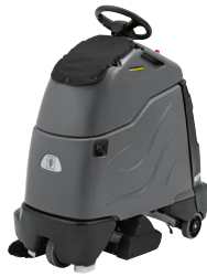
CHARIOT™ 2 IVAC 24 ATV