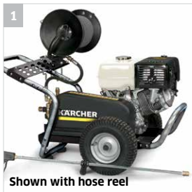
Shown with hose reel