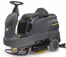
B 90 R ADV BP