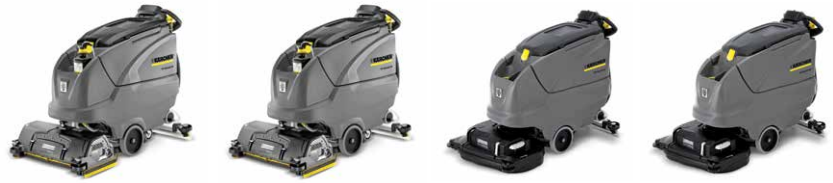
B 80 W BP + R 65 B 80 W BP + R 75 B 80 W BP + D 65 B 80 W BP + D 75