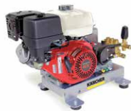
Direct Drive Cart and Skid