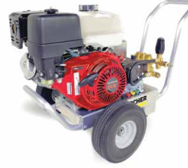
Belt Drive Cart and Skid