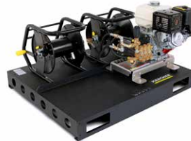
HD Pallet Skid with 2 Hose Reels 1