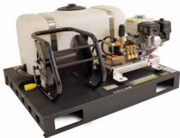
HD Pallet Skid with Tank o