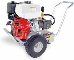
Direct Drive Cart and Skid