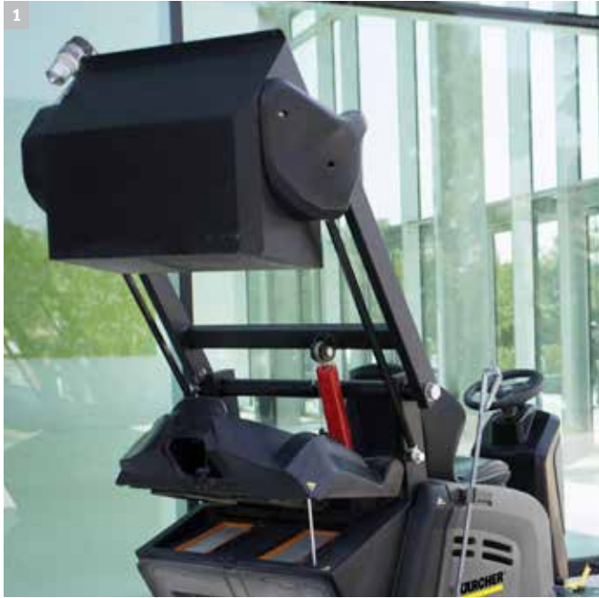
1 Container lift on KM 105/110 R The hydraulic container lift can reach a height of 61". The waste container tilts backwards to protect the operator from dust dispersion.

The KM 105 can be custom-tailored to suit your individual requirements. A wide selection of options allows you to configure the machine in virtually any combination needed to get the job done. Choose from a variety of seats, tires, and side brushes, and safety accessories including a canopy, flashing beacon, working lights and much more!