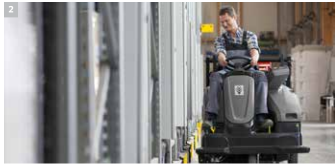
2 Emission-free battery power The environmentally-friendly battery drive can be used both indoors and outdoors.