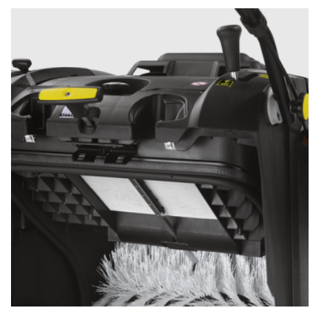
Efficient filter system with mechanical filter cleaning