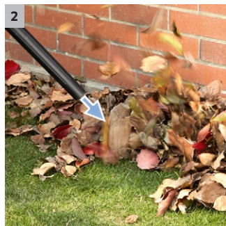
2 Practical blower function