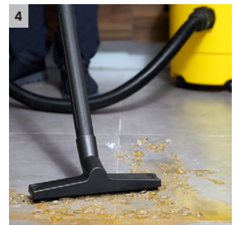
4 Diverse applications