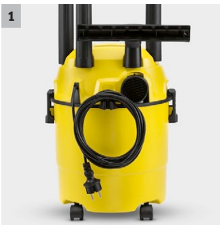
1 Practical cable and accessory storage