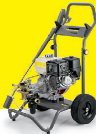
High-pressure cleaners with a combustion engine