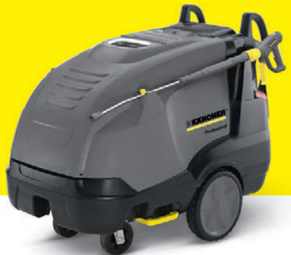
Hot water high-pressure cleaners