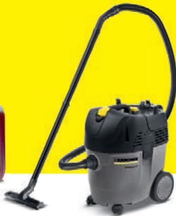
Wet and dry vacuum cleaners