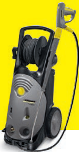
Cold water high-pressure cleaners

The story of Hercules mucking out King Augeias' stables, which housed 3000 cattle, in just one day is an old myth. Nowadays, our machines make completing such a task just part of the routine - be it accommodation for cattle, pigs, poultry, aquaculture, fisheries or cleaning tasks in animal accommodation, around the farm, in the production facility, the cold store, the farm shop or around the house. And it's always best to play it safe: with the Kärcher system.