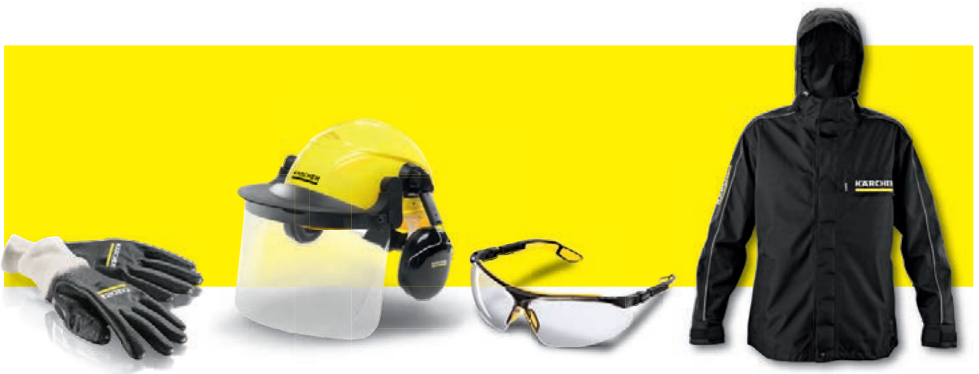
Gloves Fit like a second skin.