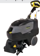
Armada BRC 40/22 C