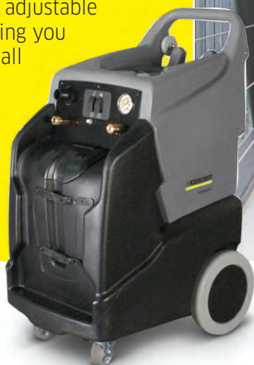
PUZZI 64/35 C

Kärcher's Box & Wand Carpet Extractors are available in cold and hot water models with adjustable water pressure, providing you with the flexibility for all your carpet cleaning requirements.