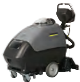
BRC 46/76 W