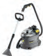
Puzzi 8/1 C