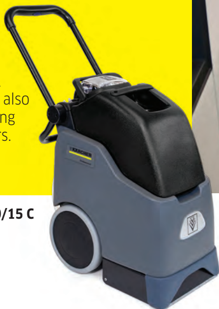
BRC 30/15 C

Kärcher's Compact Carpet Extractors are ideal for cleaning smaller to medium-sized carpets, upholstery and textile flooring. Some units are also ideal for cleaning vehicle interiors.