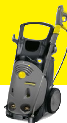
Cold water high-pressure cleaners