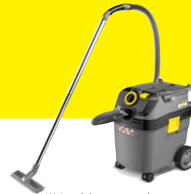
Wet and dry vacuum cleaners