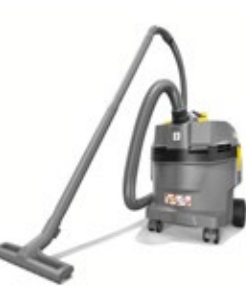
Wet and dry vacuum cleaners