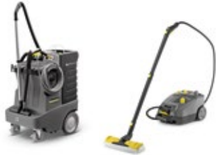
Steam cleaners and multi-function devices