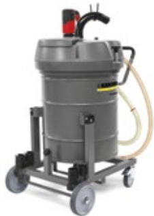
Industrial vacuum cleaners