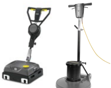
Scrubbers and single-disc machines