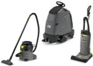
Dry vacuum cleaners