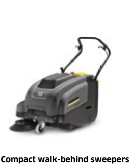
Compact walk-behind sweepers