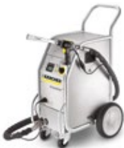
Dry ice blasters