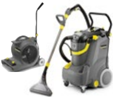
Spray extraction cleaners and air blowers