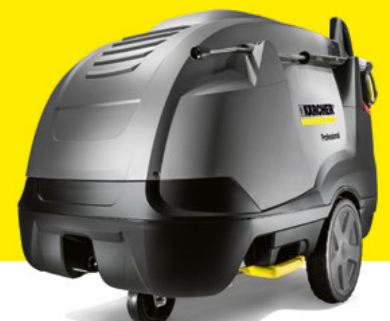
Hot water high-pressure cleaners