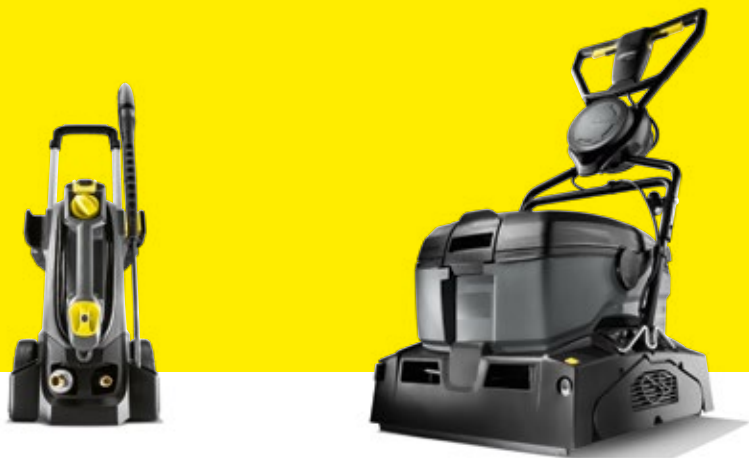
Cold water high-pressure cleaners

What good is power without reliability? Why have robustness without safety? You need all of these features in a machine. In every machine. And guaranteed in every Kärcher Professional. We develop our machines in collaboration with professionals from the respective field. This means that you not only get a good machine, but the best machine for your requirements: powerful, robust, safe and reliable.