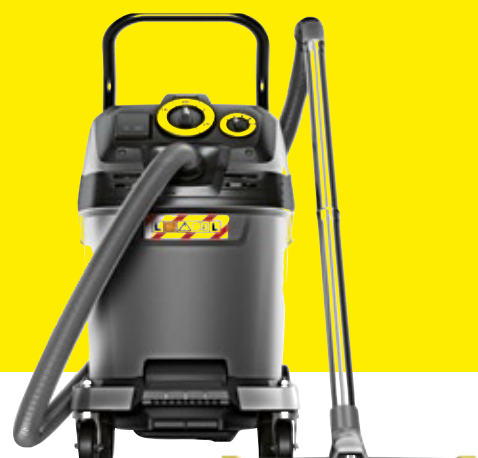
Wet and dry vacuum cleaners