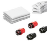
Multipurpose accessory kit (2.863-215.0)