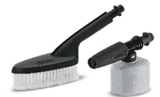
Car Cleaning Kit (2.643-033.0)