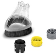
Splash Guard (2.642-706.0)