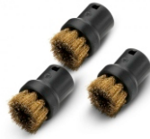
Round brush with brass bristles (2.863-061.0)