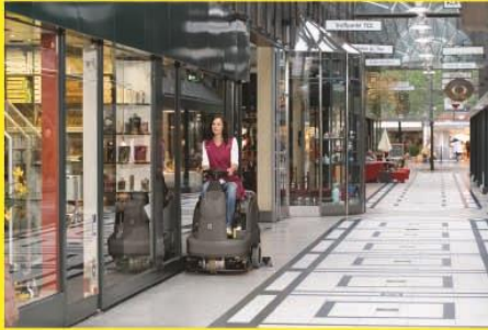
Mall/Exhibition Hall Area