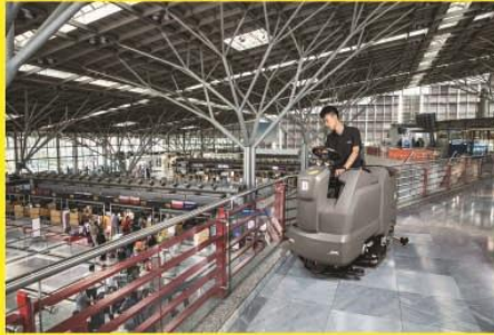
Public Transportation Area