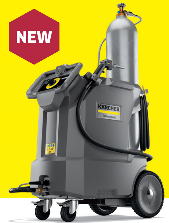
IB 10/8 L2P

With our new patented L2P dry ice blaster you can remove all types of dirt. Also where no water can be used, e.g. for electronic and other live components. The new L2P is the only dry ice blaster which produces the dry ice pellets itself – directly from the CO 2 cylinder. A procedure patented by Kärcher.