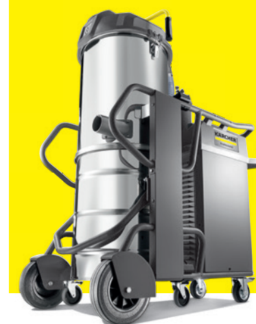
IVS 100/75 M