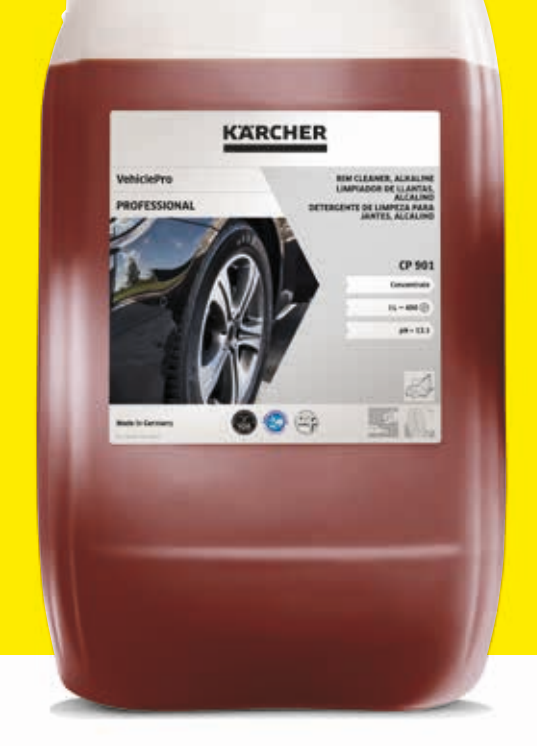
Rim Cleaner, alkaline CP 901