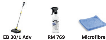
EB 30/1 Adv RM 769 Microfibre