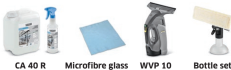
CA 40 R Microfibre glass WVP 10 Bottle set