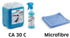
CA 30 C Microfibre