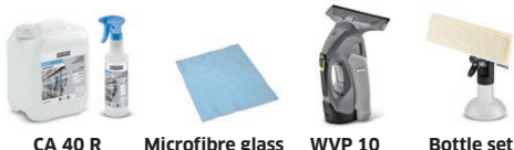
CA 40 R Microfibre glass WVP 10 Bottle set