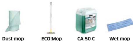
Dust mop ECO!Mop CA 50 C Wet mop