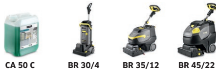
CA 50 C BR 30/4 BR 35/12 BR 45/22