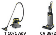
T 10/1 Adv CV 38/2