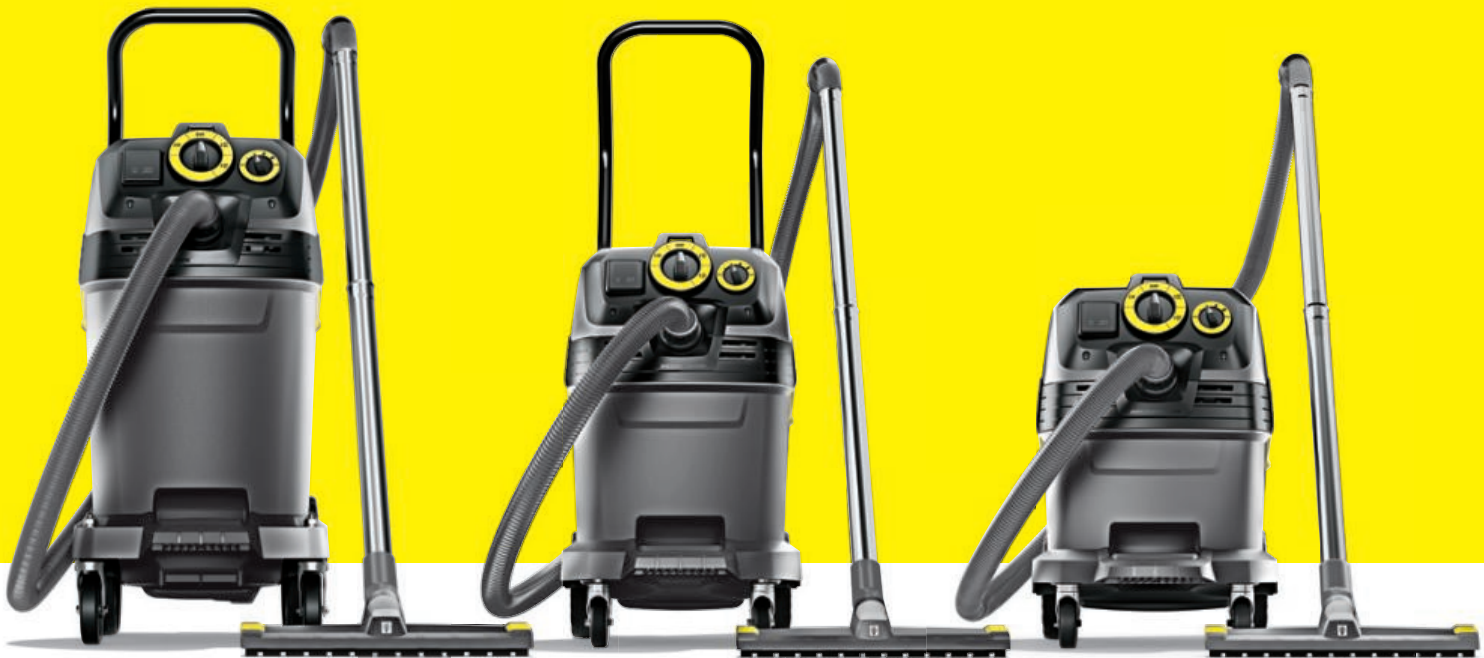
NT 50/1 Tact Te L

Our range of wet and dry vacuum cleaners is based on decades of experience. And that of many professional users. We have developed our new NT Tact machines together with tradesmen, industrial operators, vehicle finishers and other occupational groups to ensure that you have an NT Tact for every purpose and application.