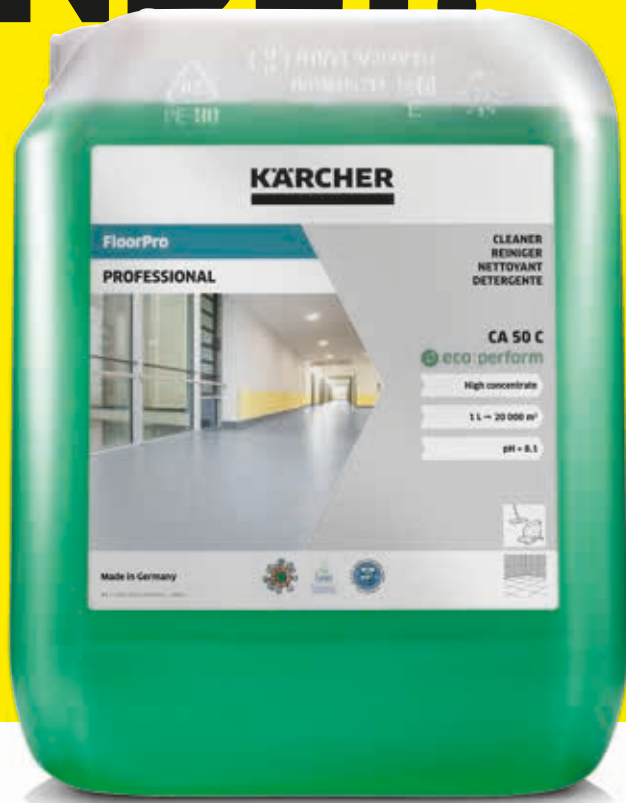
FloorPro Cleaner CA 50 C eco!perform