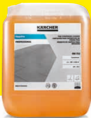
FloorPro Fine Stoneware Cleaner RM 753