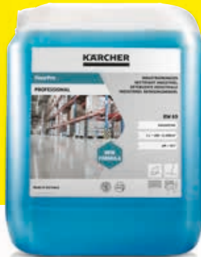
FloorPro Industrial Cleaner RM 69

Depending on the location of use, the floor covering and how dirty it is, Kärcher recommends various cleaning agents to be used with the KIRA B 50 cleaning robot – every one, of course, perfectly tailored to the machine, safe to use and environmentally friendly.