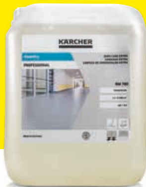
FloorPro Wipe Care Extra RM 780