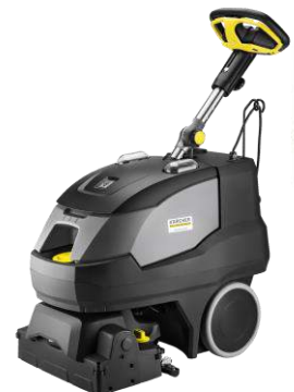
BRC45/45 C Carpet Cleaner