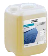
BRS43/500 C Carpet Cleaner

Suitable for intermediate carpet cleaning