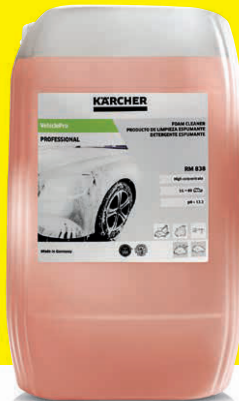
VehiclePro Foam Cleaner RM 838