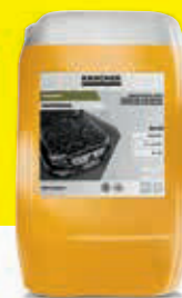
VehiclePro High-Pressure Wash RM 806