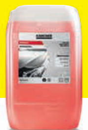
VehiclePro Hot Wax RM 820 Classic