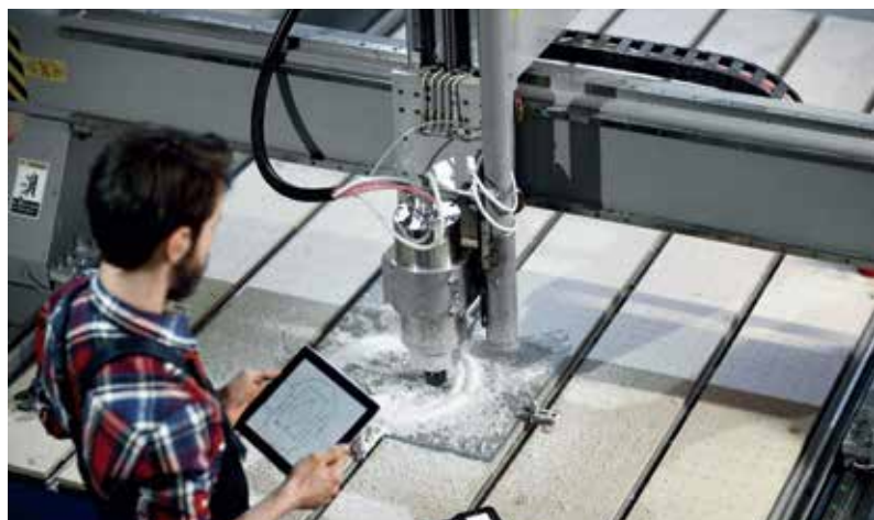
Processing of Glass & Stone