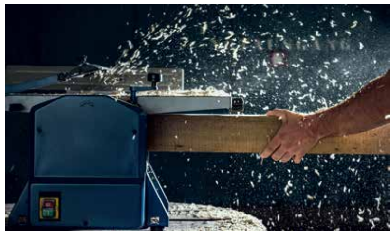
Processing of Lumber