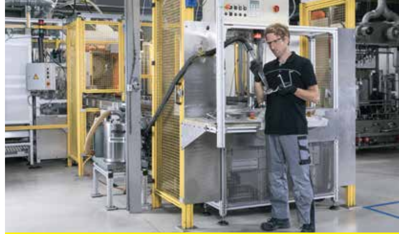
Metallurgy & Metal-Forming