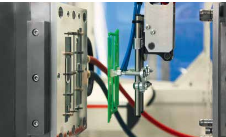
Manufacturing of Rubber & Plastics