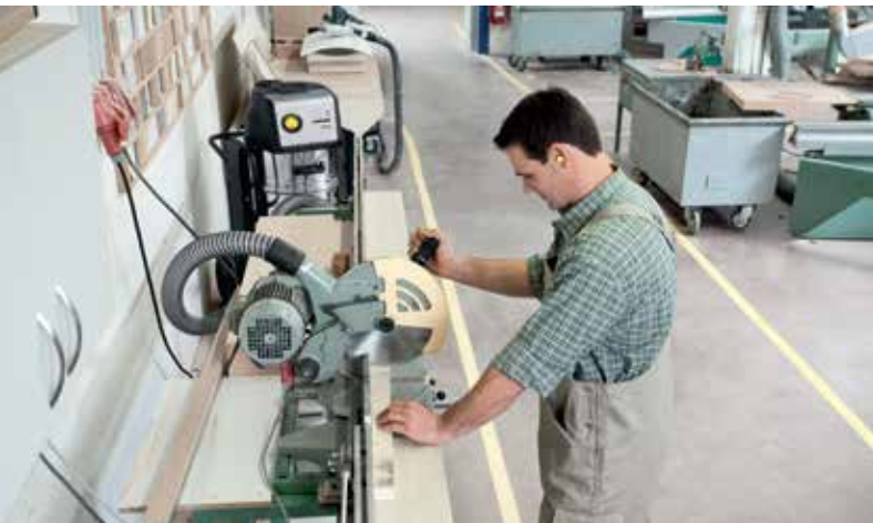
Manufacturing of Furniture