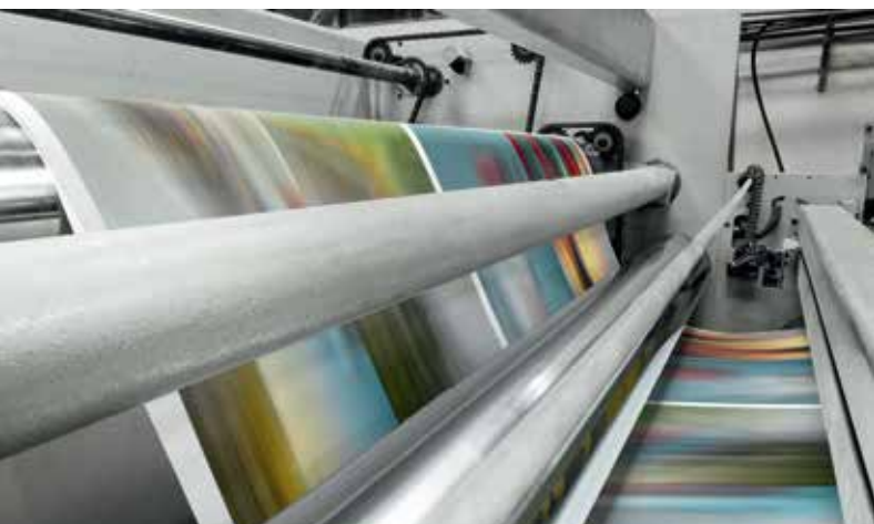
Manufacturing of Print Media