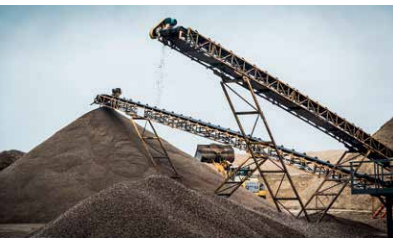
Processing of Coke & Refined Minerals