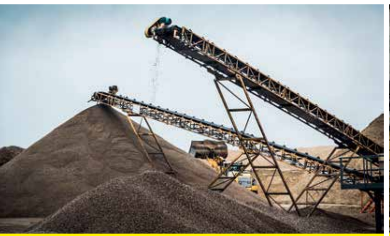
Processing of Coke & Refined Minerals