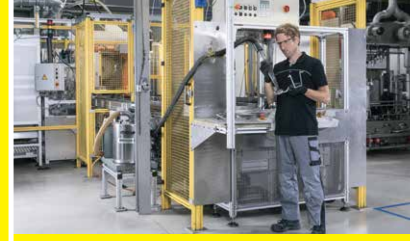
Metallurgy & Metal-Forming