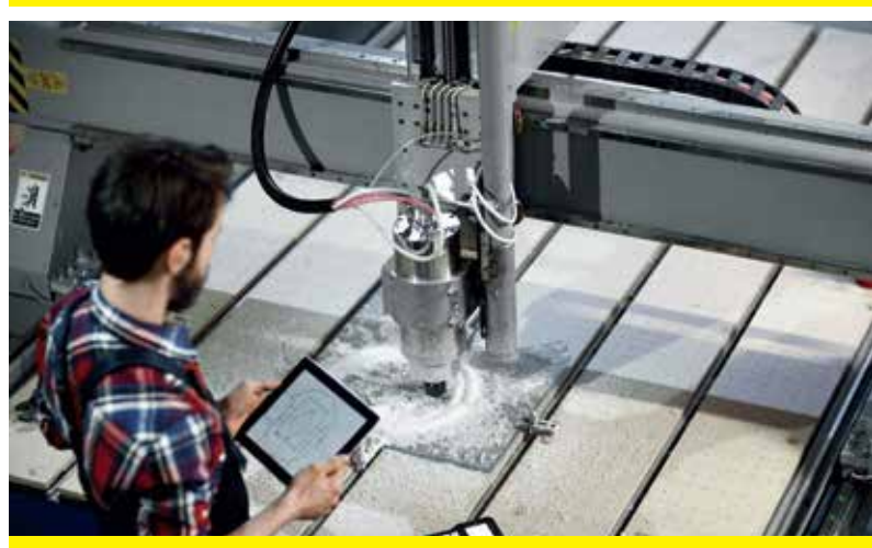
Processing of Glass & Stone