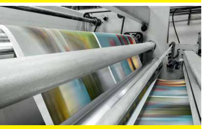
Manufacturing of Print Media