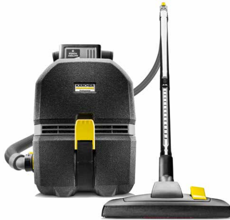
BVL 3/1 BP