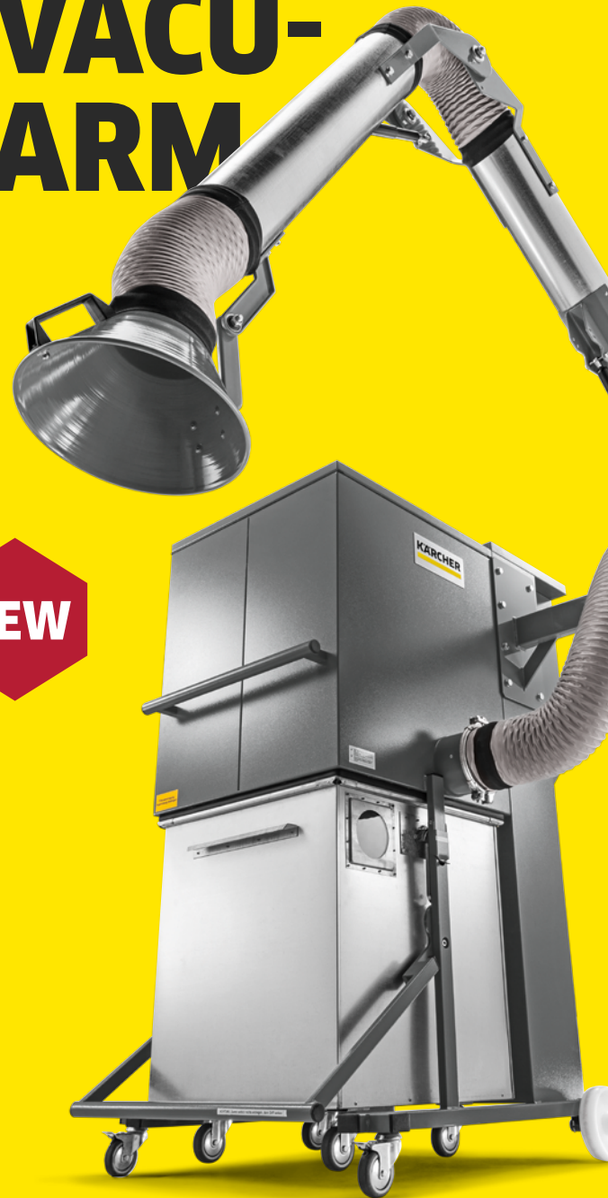
ID 130/22 with arm 9.990-920.0