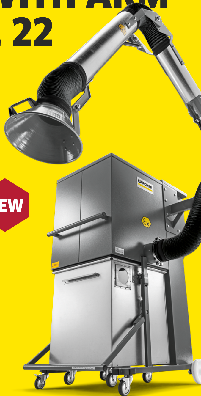
ID 130/22 Z22 with arm 9.990-921.0