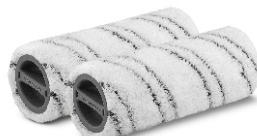
Roller Set, Grey (2.055-007.0)