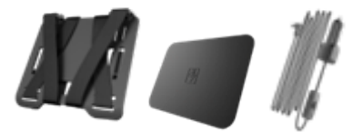
Power Line, Leather Cushion & Binding Fixation Support (Apply to Vehicle Seat) (2.863-285.0)