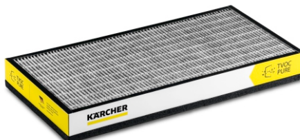
TVOC Pure Filter (2.863-248.0)