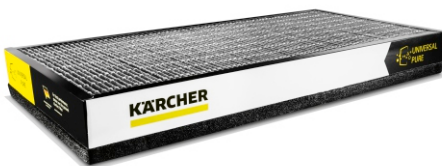
Universal Filter (2.863-246.0)