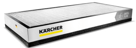
Smog Pure Filter (2.863-247.0)