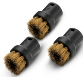
Round brush with brass bristles (2.863-061.0)