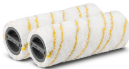
Roller Set, Yellow (2.055-006.0)