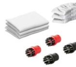
Multipurpose accessory kit (2.863-215.0)