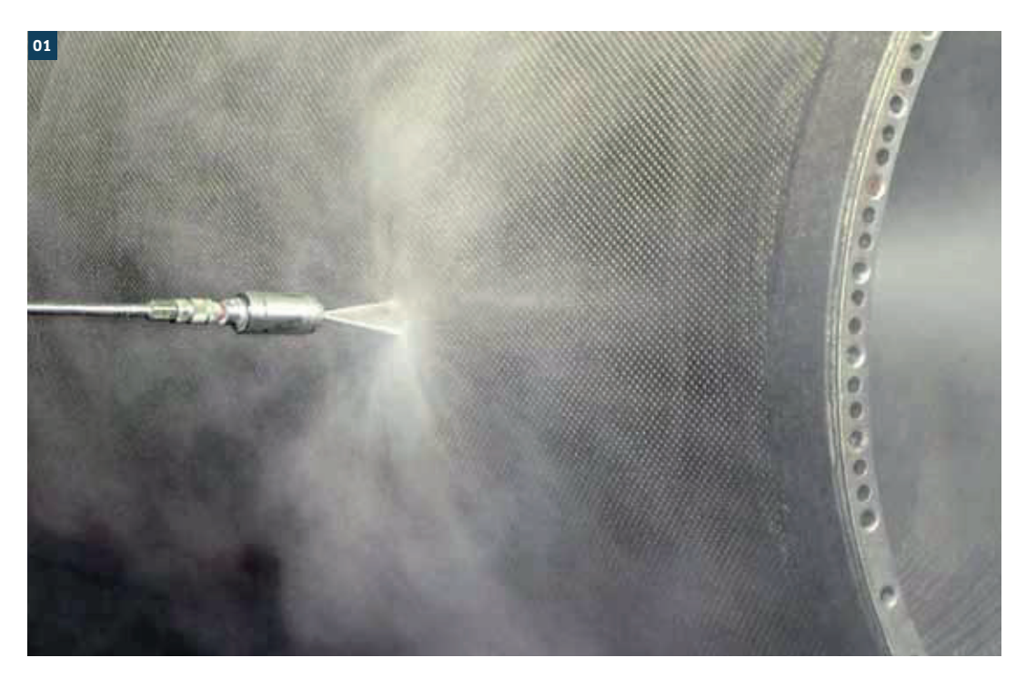
01_ WOMA® offers many water tools for the thorough cleaning of sieves and filters.